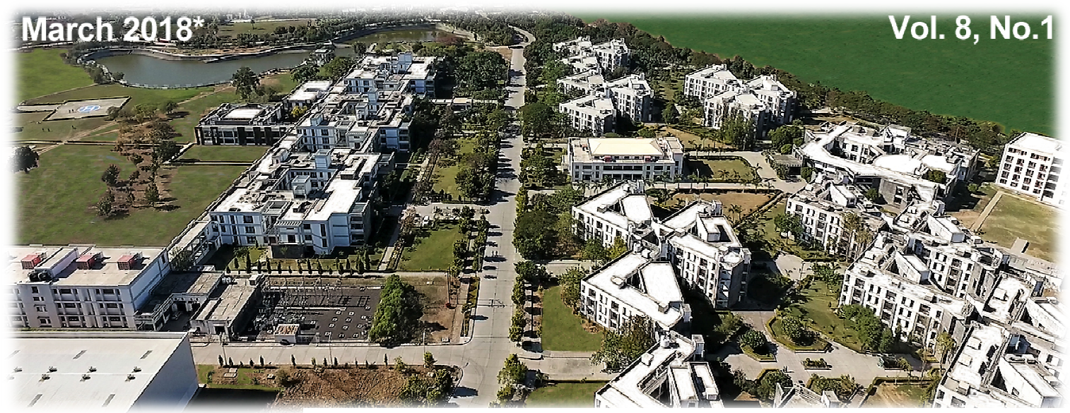
* VOL. 8 NO.1 OF JUET CHRONICLE COVERS INFORMATION FROM AUGUST 2017 TO JANUARY 2018.